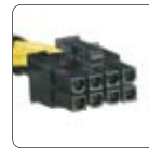
x2 EPS/ATX12V 8-pin and 4-pin compatible