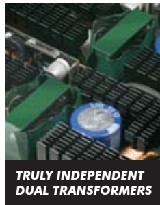
TRULY INDEPENDENT DUAL TRANSFORMERS