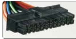
x1 ATX 24-pin & 20-pin compatible