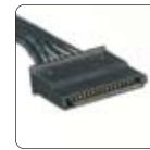
x12 SATA connectors