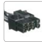
x6 PCI-Express 8-pin and 6-pin compatible