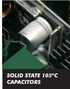
SOLID STATE 105°C CAPACITORS