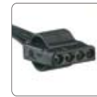
x12 4-pin Molex connectors