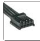
x2 Floppy connectors