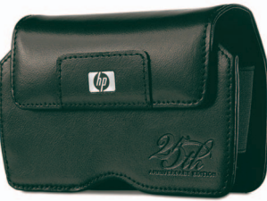
Leather commemorative pouch included